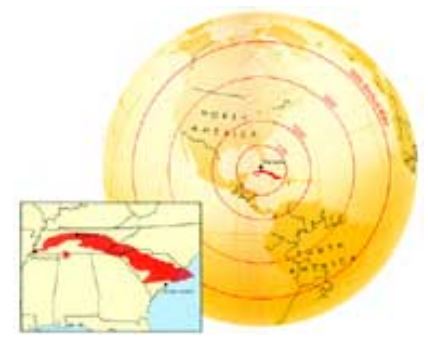
Click to Enlarge Image

Capital: La Habana (Havana). Term for residents: Habaneros (males), Habaneras (females).